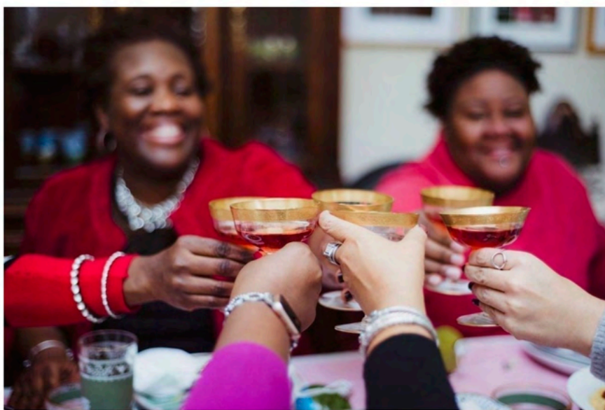
Photography by Chantilly Lace Photography

Contributed by Michiel Perry of Black Southern Belle