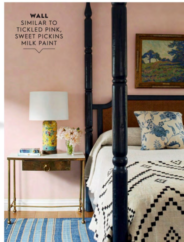
WALL SIMILAR TO TICKLED PINK, SWEET PICKINS MILK PAINT

ADD SUBTLE TEXTURE Dunham painted walls a custom milk paint. "I love the matte and mottled effect," he says. Embossed wallpaper can also create a tactile feel. ■