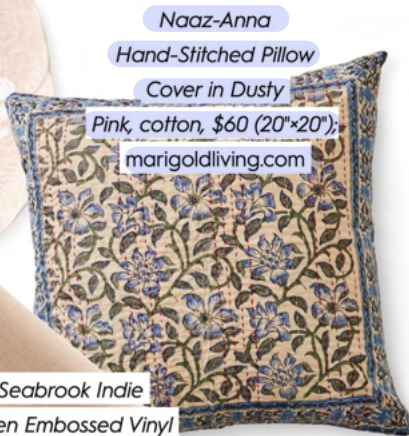
Naaz-Anna Hand-Stitched Pillow Cover in Dusty Pink, cotton, $60 (20"×20"); marigoldliving.com