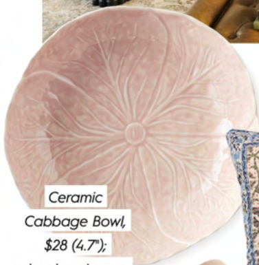
Ceramic Cabbage Bowl, $28 (4.7"); shopterrain.com

"Black counters the paleness of pink and keeps it from feeling juvenile," Dunham says. In this bedroom, below , he contrasted pink walls with a black bed frame and patterned blanket.