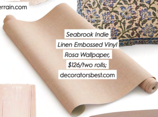
Seabrook Indie Linen Embossed Vinyl Rosa Wallpaper, $126/two rolls; decoratorsbest.com