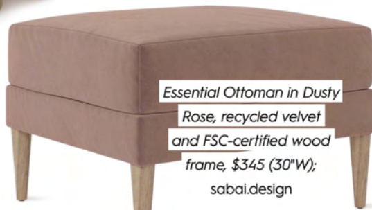
Essential Ottoman in Dusty Rose, recycled velvet and FSC-certified wood frame, $345 (30"W); sabai.design