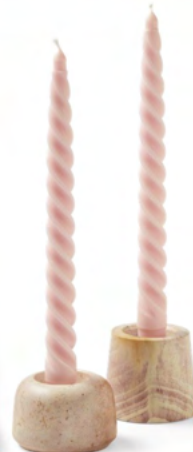
Pink Twisted Taper Candles, $12/pair; paddywax.com. Soapstone Holders, $35 each; augustsage.com