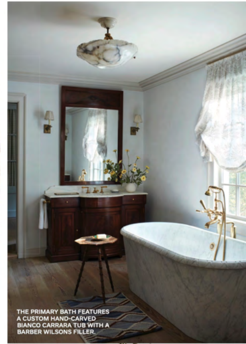
THE PRIMARY BATH FEATURES A CUSTOM HAND-CARVED BIANCO CARRARA TUB WITH A BARBER WILSONS FILLER.