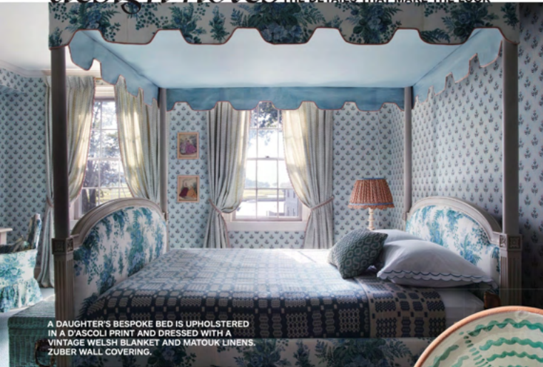
A DAUGHTER'S BESPOKE BED IS UPHOLSTERED IN A D'ASCOLI PRINT AND DRESSED WITH A VINTAGE WELSH BLANKET AND MATOUK LINENS. ZUBER WALL COVERING.