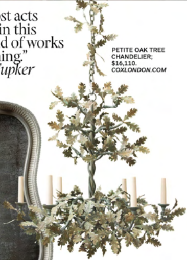
PETITE OAK TREE CHANDELIER; $16,110. COXLONDON.COM

“Blue almost acts as a neutral in this house; it kind of works with everything.” —Virginia Tupker