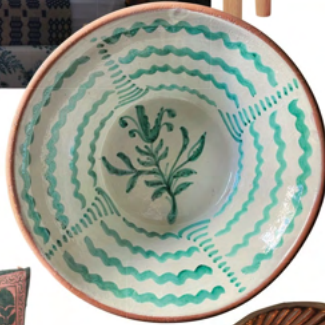
TALAVERA FLOWER PLATTER; PRICE UPON REQUEST. GETTHEGUSTO.COM

“We wanted something elegant but not at all fussy.” —the homeowner