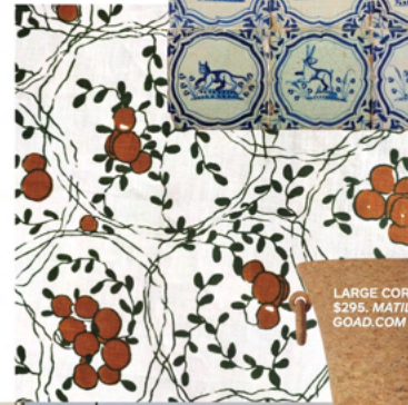
LARGE CORK URN; $295. MATILDA GOAD.COM