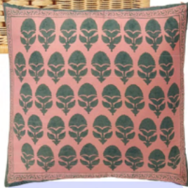
ROZA-GULSHAN REVERSIBLE PILLOW COVER; $60. MARIGOLDLIVING.COM

“We wanted something elegant but not at all fussy.” —the homeowner