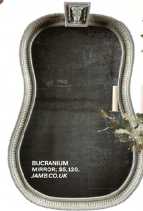
BUCRANIUM MIRROR; $5,120. JAMB.CO.UK