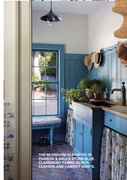
THE MUDROOM IS PAINTED IN FARROW & BALL'S STONE BLUE. CLAREMONT FABRIC BENCH CUSHION AND CABINET SKIRTS.

INTERIORS: ISABEL PARRA. ALL PRODUCTS COURTESY OF THE COMPANIES.